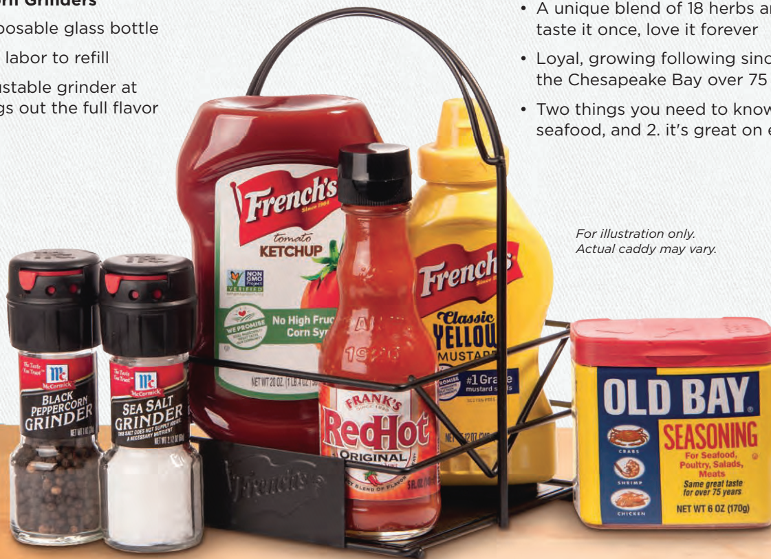
For illustration only. Actual caddy may vary.

Offer valid on purchases from January 1, 2018–December 31, 2018.